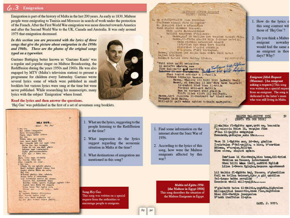
Example 3: Early twentieth century song lyrics